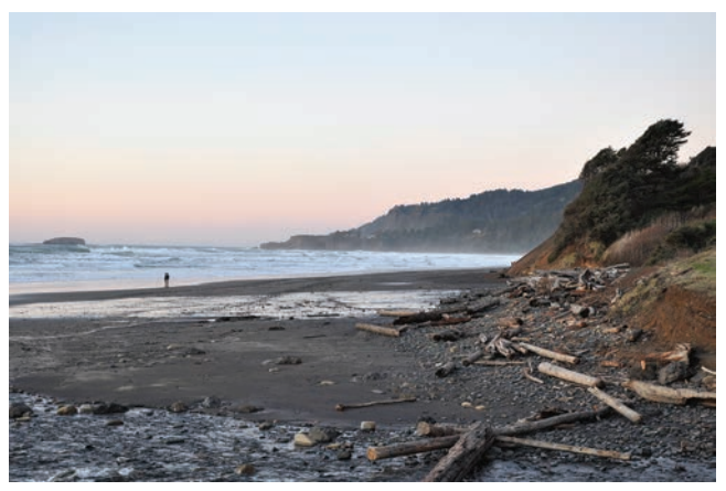
Fig. 3. —View of the beach and Pacific Ocean at Beverly Beach State Park along the Oregon coast just west of Corvallis, site of the 1979 picnic hosted by Oregon State University.

teachers among us saw a beautiful, complete lobster on her plate, she immediately, and without thinking, automatically determined the sex of her lobster. When she realized what she had done, she stepped aside and watched as others came through the line. Sure enough, every zoology teacher in the bunch automatically determined the sex of their lobster before diving in. Another experienced zoologist (who was also a native New Englander) offered to assist landlubbers in the fine art of disassembling and eating lobsters for the low, low price of just one lobster claw. She ate well that evening. However, it was the bivalves, apparently, that were especially memorable that year in that their bacterial count kept a fair number of mammalogists up half the night. Annual Meetings along the East Coast often featured a clambake-type picnic (University of Rhode Island, 1980; University of Maine, 1985). Known as the New England clambake, a traditional method of cooking seafood, such as lobsters, crabs, and clams and other bivalves, is by steaming the ingredients in pits, covered by layers of seaweed. The shellfish can be accompanied by vegetables, such as onions, carrots, and corn on the cob. Clambakes are festive occasions along the coast of New England.