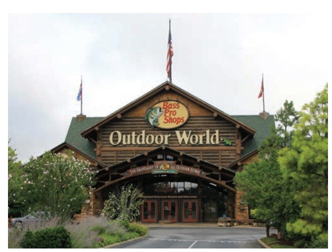
Fig. 5. —Bass Pro Shops. The 2005 ASM Annual Meeting was hosted by Southwest Missouri State University and the picnic was held in the parking lot of the Bass Pro Shops in Springfield.

In Laramie, Wyoming in 2010, we gathered at the Wyoming Territorial Prison State Historic Site where the infamous Butch Cassidy had been held—a prison venue for a picnic caused some bemusement and seemed fitting. While some picnic locations tend to serve merely as an outdoor background for socializing, the Territorial Prison boasts one of the oldest buildings in Wyoming. Curious mammalogists and history buffs enjoyed exploring this interesting site both before and after the meal. Offsite picnics always provide fun, enriching educational experiences and a great opportunity for interaction with colleagues, but also add to the cost with the need to provide transportation to the venue. The State of Kansas, one of the historical homes of the ASM, has provided interesting weather experiments to test even the hardiest field mammalogists. At the 1991 Annual Meeting at Kansas State University, Manhattan, early arrivals watched a tornado cruise overhead within a half mile of us—a first for many attendees who instead of taking shelter in a basement were outside enjoying the experience. The picnic exposed many to a family of arthropods, the Trombiculidae (chiggers), for the first time, but now, decades later, perhaps most attendees remember best the hayrack ride across the open prairie to see the bison grazing as the sun was setting. A thermal tolerance experiment was undertaken during