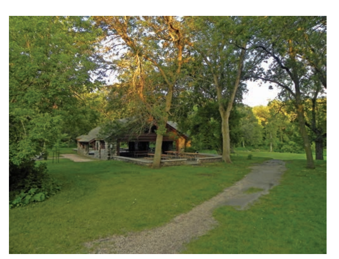
Fig. 2.—The scenic Turtle River State Park west of Grand Forks, North Dakota, site of the 1996 ASM picnic. The historic pavilion where the picnic was held was built by the CCC in the early 1930s. The park is a lovely riparian woodland located on a prominent beach ridge of Glacial Lake Agassiz. The Turtle River drains the surrounding land and flows into the Red River of the North, which ultimately empties into Hudson Bay.