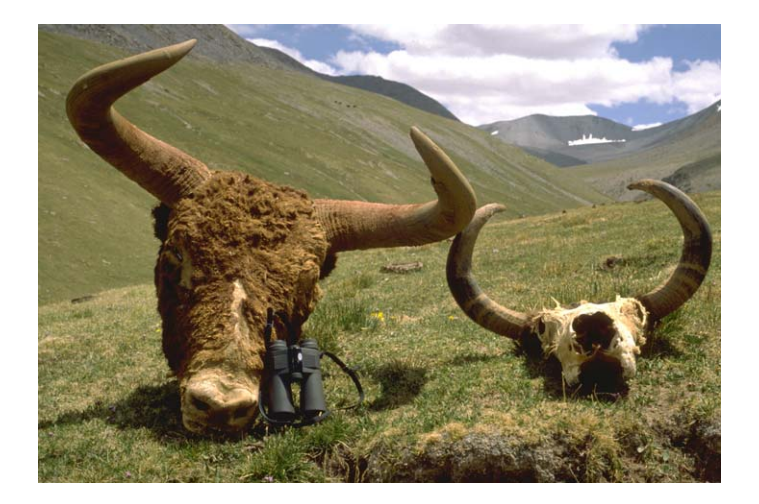
Fig. 3. —Skulls of male (left) and female (right) wild yaks ( Bos mutus ) from Yeniugou, central Qinghai, China, highlighting relative mass and sexual dimorphism in skull size and horn shape.

Relative to mass, a small female wild yak may be only one-third the size of a large male; in contrast, female domestic yaks are 25–50% smaller (Harris 2008; Miller et al. 1994; Wiener et al. 2003). Body mass (kg) of adult male wild yaks has been estimated at >800 kg (Engelmann 1938) and as high as 1,000 kg (Schäfer 1937; Wiener et al. 2003:43) and 1,200 kg (Lu 2000; Lu and Li 1994); females are about