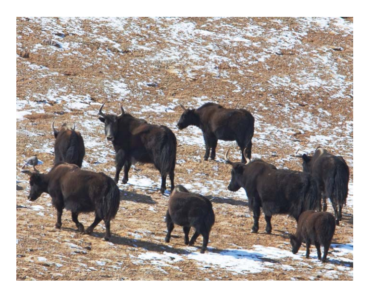
Fig. 5. —Wild yak ( Bos mutus ) adult females and calves in Yeniugou, central Qinghai, China.

males advancing to reconnoiter" (Przewalski 1876:190; Rawling 1905; Schaller 1998).