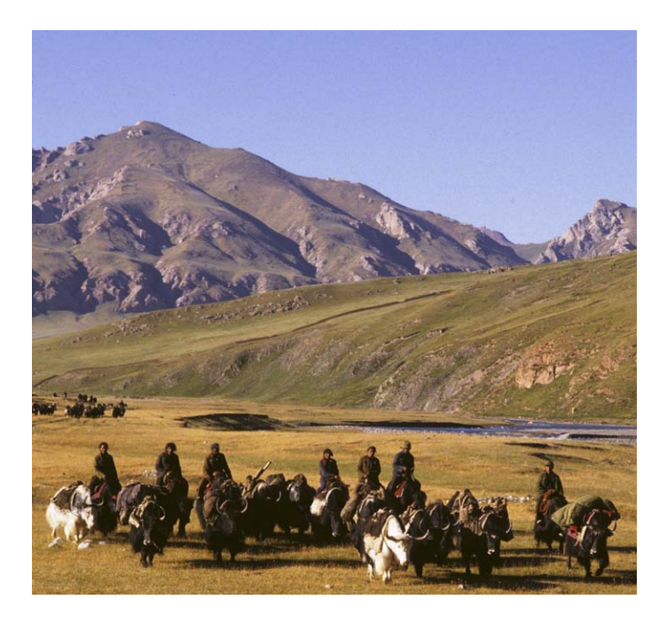
Fig. 6. —Nomadic pastoralists were dependent on domestic yaks ( Bos grunniens ) to move supplies throughout the Tibetan Plateau; trucks now deliver most supplies.

Because of the harsh environmental conditions in the Tibetan Plateau, the genesis and persistence of nomadic pastoralism likely involved an early domesticated form of the wild yak (Buchholtz and Sambraus 1990; Goldstein and Beall 1990). Although the specifics of the domestication of the yak are obscure (Rhode et al. 2007), it is thought to have occurred during at least 2 separate events (Bailey et al. 2002) in the northern part of Tibet (Flad et al. 2007). The 2,500-year-old Ordos Bronzes of the horned heads and bodies of domestic yaks that form buckles and plaques from Tibet through southern Russia attest to the species' cultural importance after domestication (Olsen 1986).