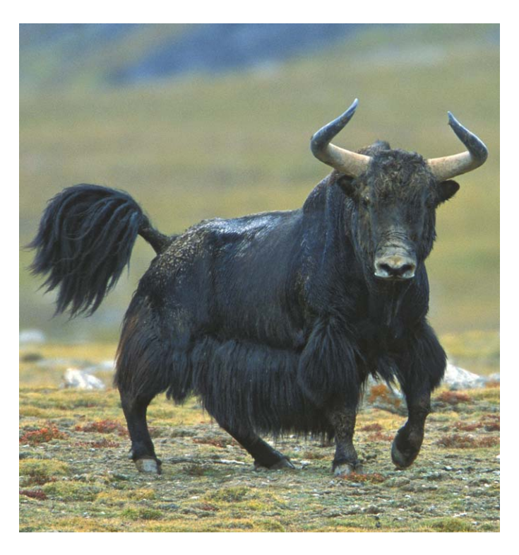
Fig. 1.—Mature male wild yak ( Bos mutus ) in Yeniugou, central Qinghai, China.