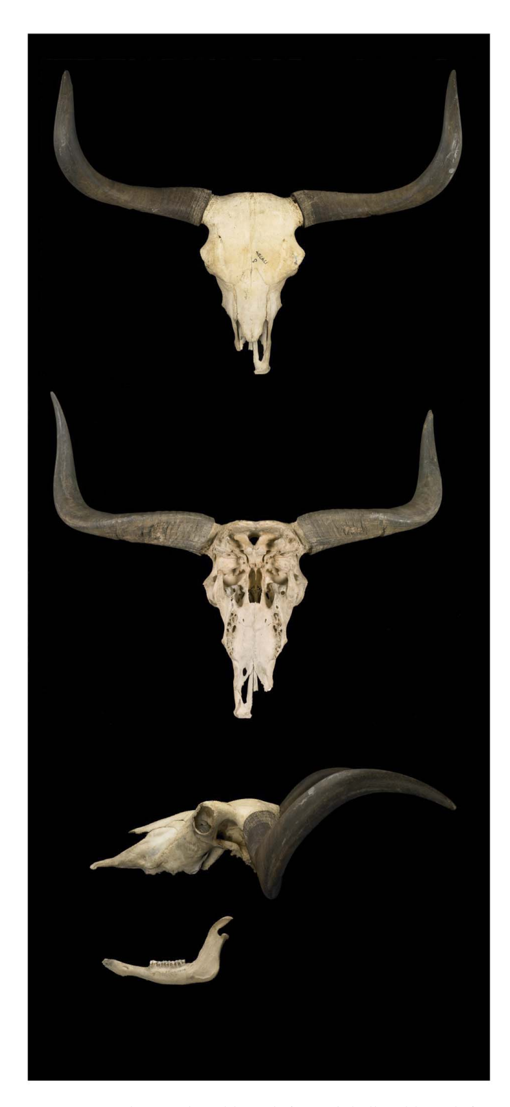
Fig. 4.—Dorsal, ventral, and lateral views of skull and lateral view of mandible of an adult male domestic yak ( Bos grunniens ); zoo specimen of unknown origin (National Museum of Natural History, specimen 174734). Greatest length of skull 525 mm.

The alimentary organs of the yak have evolved to deal with the limited forage availability and quality in its native range (Wiener et al. 2003). The mouth is broad, muzzle small, and lips flexible. Incisors have flat grinding surfaces,